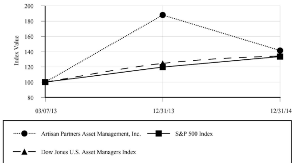
Total Return Comparison

The following graph compares the cumulative total stockholder return on our Class A common stock from the date the shares began trading on the NYSE on March 7, 2013 to December 31, 2014, with the cumulative total return of the S&P 500 ® and the Dow Jones U.S. Asset Managers Index. The graph assumes the investment of $100 in our common stock and in the market indices on March 7, 2013 and the reinvestment of all dividends.