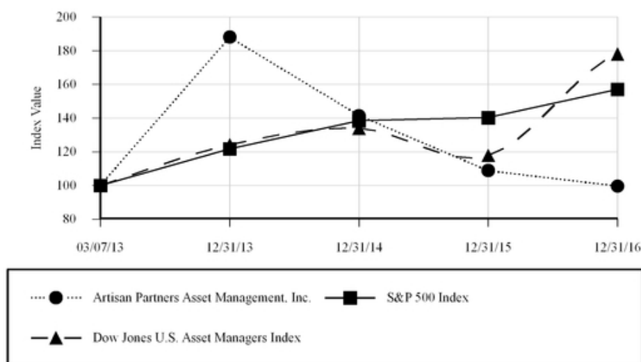
Total Return Comparison

The following graph compares the year-end cumulative total stockholder return on our Class A common stock from the date the shares began trading on the NYSE on March 7, 2013 to December 31, 2016, with the year-end cumulative total return of the S&P 500® and the Dow Jones U.S. Asset Managers Index. The graph assumes the investment of $100 in our common stock and in the market indices on March 7, 2013 and the reinvestment of all dividends.